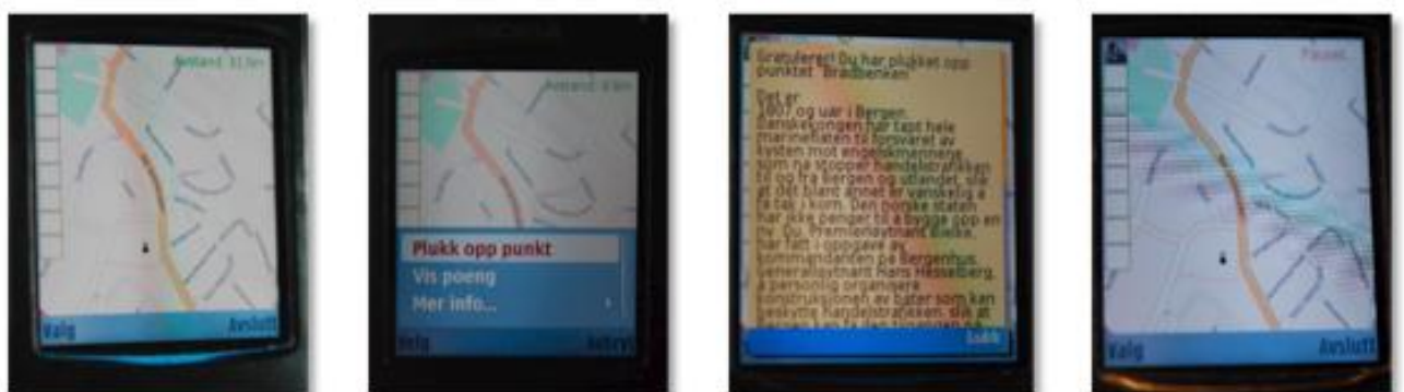
Figure 2. The mobile phone interface

The phone application (see Figure 2) interprets the data, and converts it into a game to be displayed on the phone. Displayed on the phone is the map, an optional marker displaying one's current position on the map, a track displaying the history of movement, and a bar (on the left side) displaying the icons of the places that the participant has visited. Additionally, there is a distance meter (shown in red numbers), displaying the remaining distance to the next location, which is updated every five meters. When the participant moves within a zone of 30 meters around the location, the numbers turn green, and they are permitted to 'pick up' the POI in the game. The zone of 30 meters around the location is a way of dealing with inaccuracies in creating zones in physical space by clicking on the map, potential obstacles in the physical space, and also the potential inaccuracies in GPS-data, which is contingent on several factors.